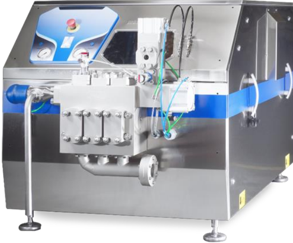
MODEL Homogenizer HA32