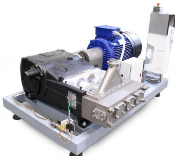
MODEL Self-Priming Pump PS32